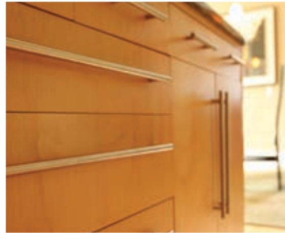
AA Plain Sliced Cherry

Realize the full potential of your project with our Architectural Series of high-end domestic and exotic hardwood veneers. Access a world-class variety of over 200 species, with no minimum order and short lead times.